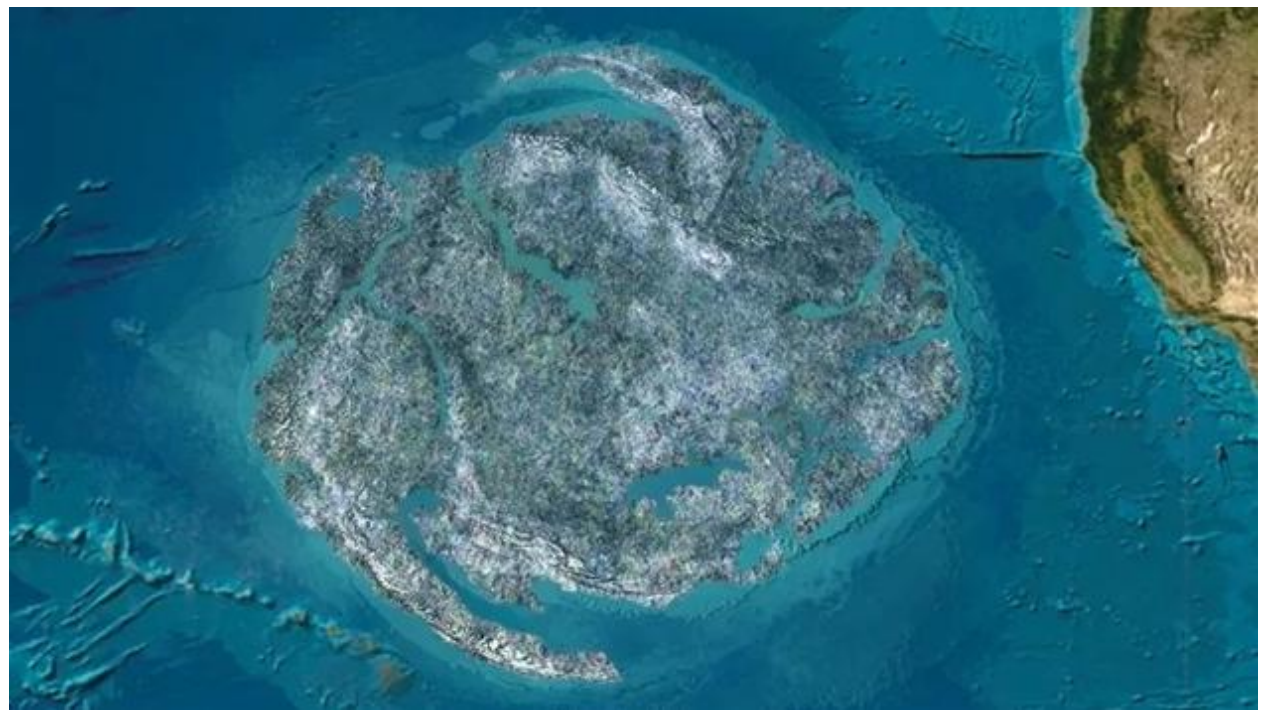
Fig. 4. View of the Big Garbage Spot from Space (eastern island)