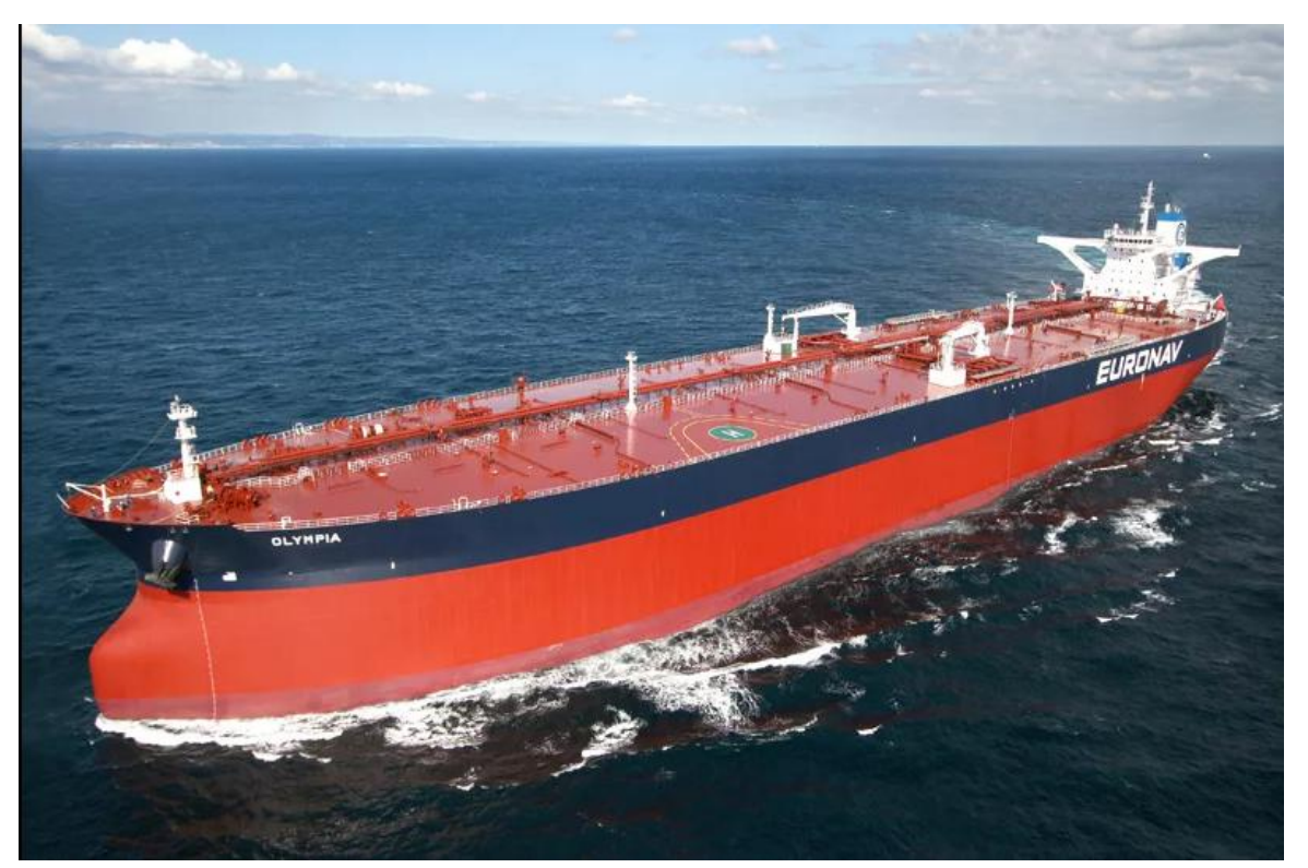
Fig. 5 VLCC tanker

Drifter nets are produced from the board of the floating base in the sea as a continuous front on the windward border of the garbage spot - on a part of it or all along perpendicular to the wind line.