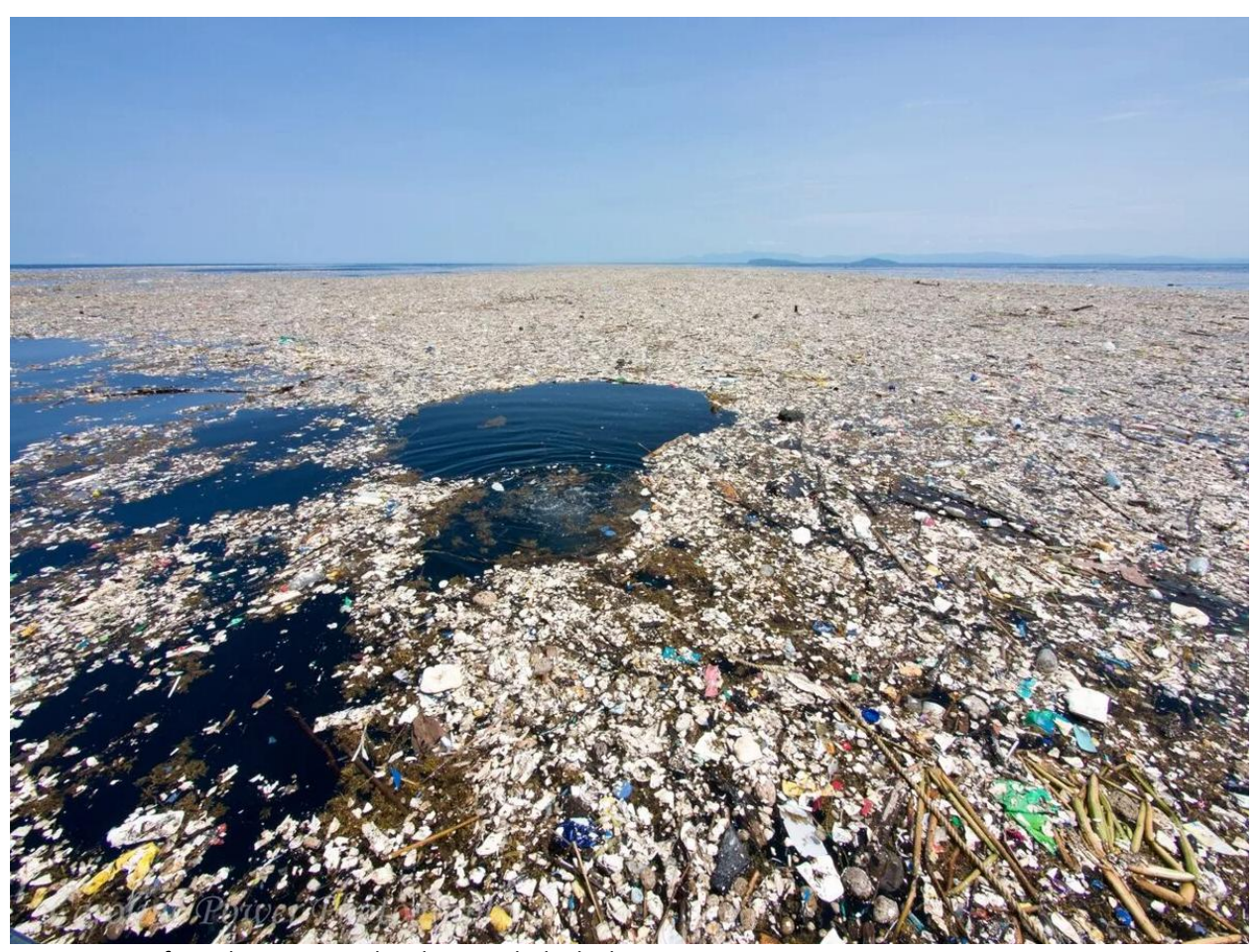
Fig. 3. Big Pacific garbage spot in the places with the highest concentration.